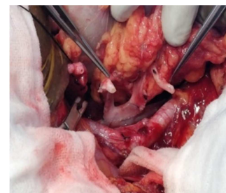
(a) vein anastomosis completed