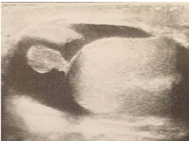
Figure 2. Reactive hydrocele and a hyperechoic swelling mass of the appendage after 5 days treatment.