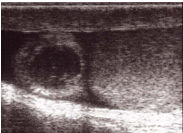
Figure 1. Longitudinal grey scale sonogram showing an enlarged hyperechoic, spherical appendix testis at onset.